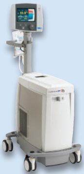
The Thermogard XP® (TGXP) Intravascular Temperature Management System (IVTM™)

Please refer to Catheter Indications for Use reference literature or visit www.zoll.com .